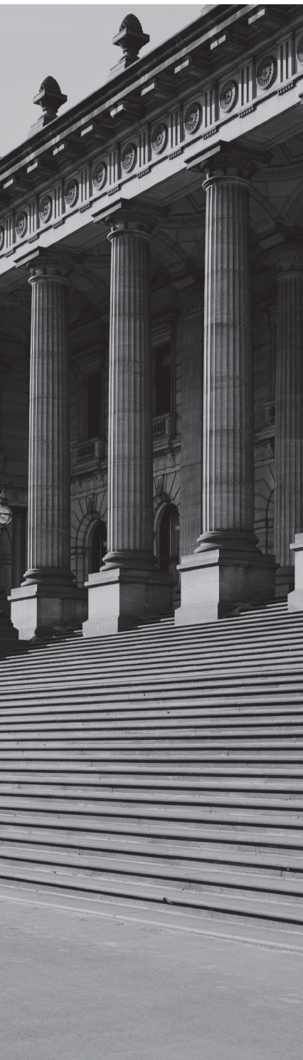
Houses of Parliament, Melbourne, Vic, July 1958

Thursday 13 October 6.30–7.45pm (refreshments from 6pm)