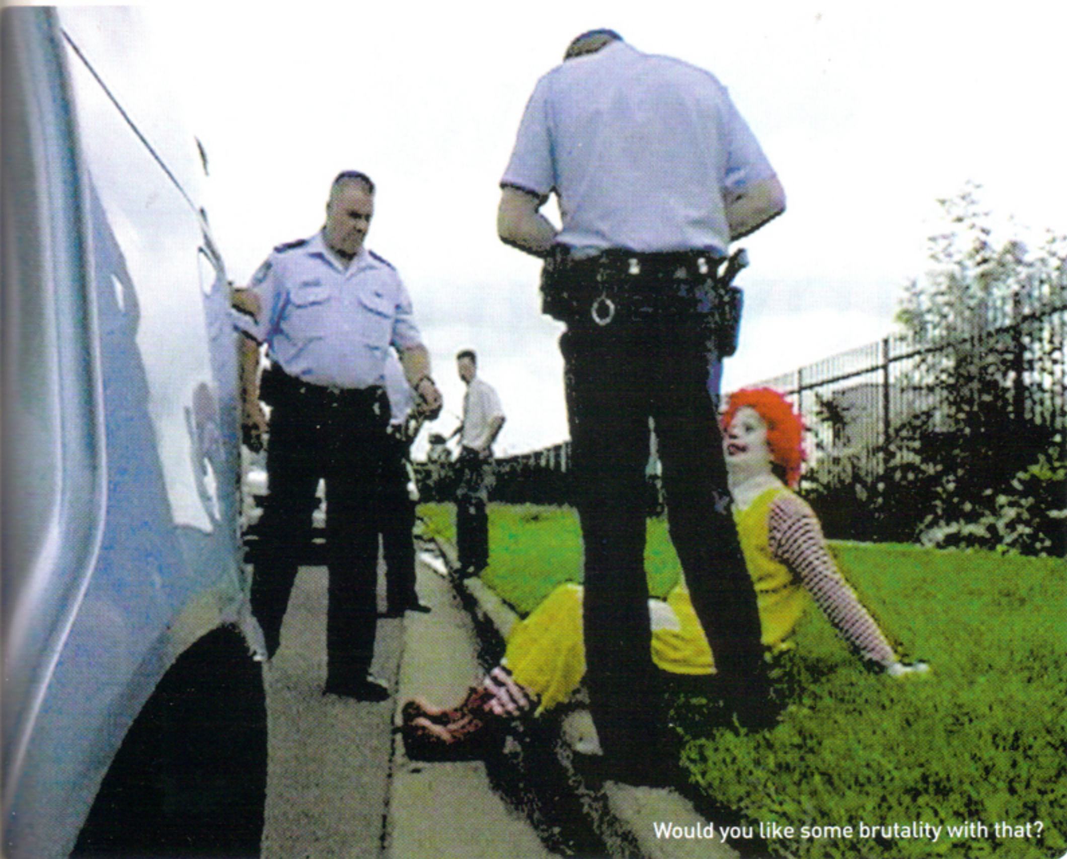
Would you like some brutality with that?