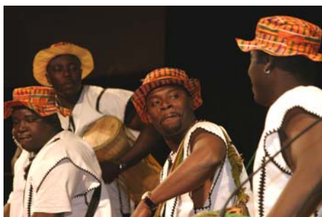
African Royal Drummers World Environment Day Awards 2003

Award winners had demonstrated best practice approach or environmental leadership across categories of Local Government, Media, Business Enterprise, Education, Community/Individual, Land and Water Management, and Triple Bottom Line .