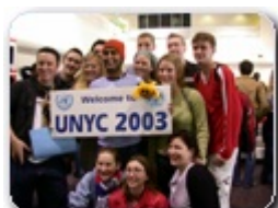
UNYA Victoria Delegates arrive at UNYC 2003

The Thant Trophy was once again held in 2003 and is estimated to continue to grow into one of Victoria's elite debating competitions for high school students. UNYA Victoria also introduced a series of education days across Victorian high schools, which are to become a permanent feature of UNYA's program of activities.