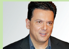
Γερουσιαστής Nick Xenophon

Nick Xenophon είναι η περίφημη ελληνική πολιτικός της Γερουσίας της Αυστραλίας. Νίκος Ξενοφών υποστηρίζει την εκλογή μου