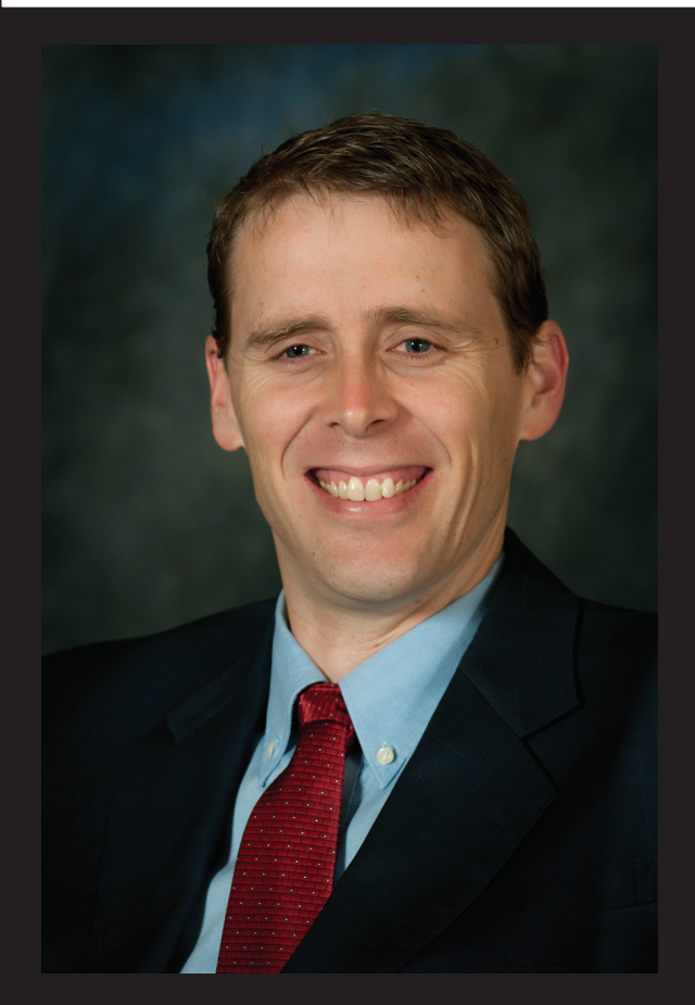
Experienced local govt councillor Walkley award winning journalist Independent commentator on the ABC Well known shareholder activist Family man with three children Former president of community kinder